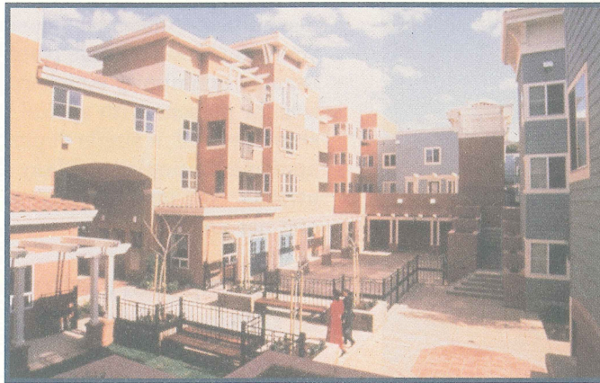
— Hismen Hin-nu Terrace, Oakland

Several factors combine to create this housing crunch: wages have not kept pace with housing costs; relatively low paying sales and service jobs are proliferating while housing options for lower wage jobs are minimal; new industries in Silicon Valley and other Bay Area towns create a premium demand for any housing; land values remain high and housing production is not meeting demand. All of these factors contribute to the current shortage of affordable housing.